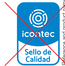
Do not place the reference vertically

Reference and product name, or process or service scope.